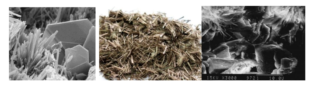
Fig. 6. Ettringite