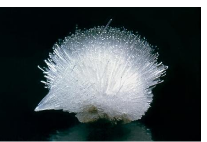
Fig. 3. Natrolite