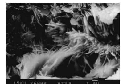
Fig. 2. Mordenite